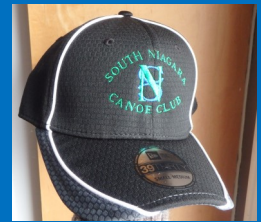
Baseball Cap, $25.