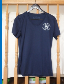
Long sleeve or short sleeve dry-fit shirt, $20.