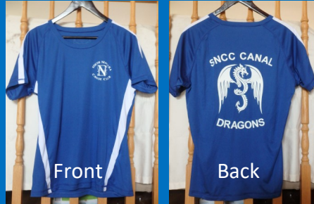
Canal Dragons Racing Shirt, $25.