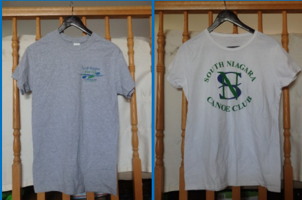
Cotton T-shirts, $15