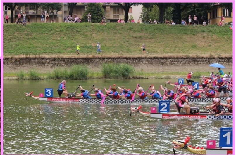
Left, the emotionally powerful breast cancer carnation ceremony. Above, Wonder Woman’s Warriors pull into the lead. Below, the Wonder Woman’s Warriors team photo.