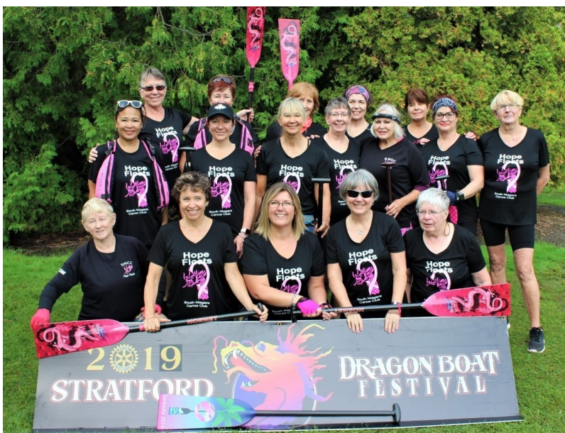
Hope Floats at Stratford, 2019

We welcome all SNCC members to participate in this ground-breaking event. If all our dragon boaters come together our club has the potential of having five crews racing (1 BCS, 2 Mixed Cancer Survivor and Supporter, 2 Special Needs). Of course, as with any festival, volunteers will be greatly appreciated. Sponsorship opportunities are available.