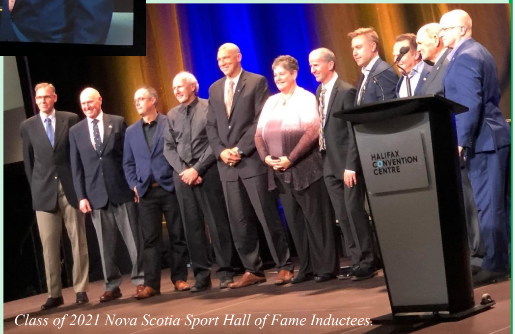
Class of 2021 Nova Scotia Sport Hall of Fame Inductees.