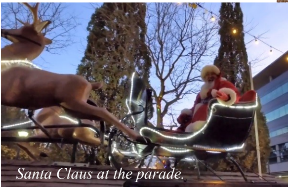
Santa Claus at the parade.