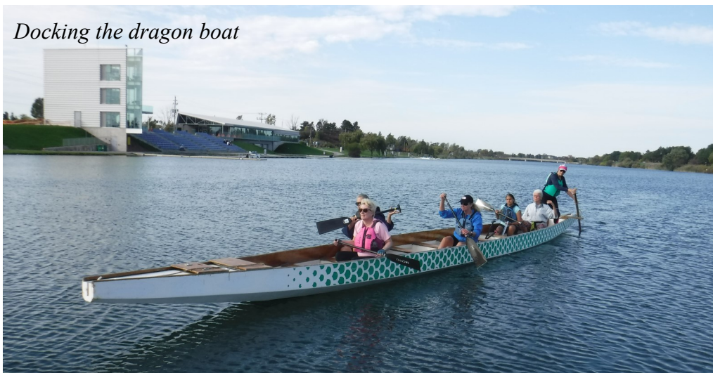
Docking the dragon boat