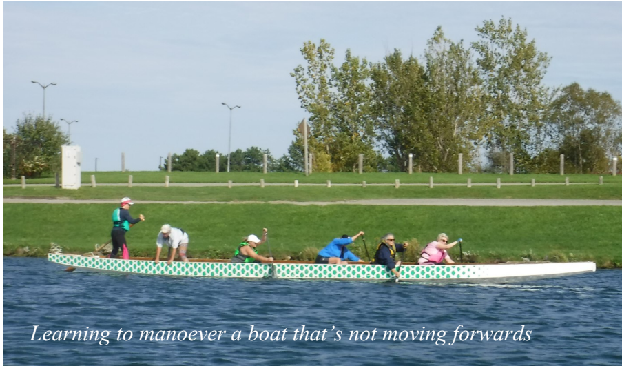
Learning to manoever a boat that's not moving forwards