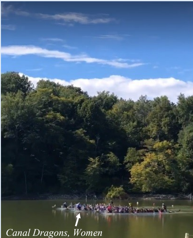
Canal Dragons, Women

Held September 24 at Christie Lake Conservation Area, west of Hamilton. It was a chilly start to the day but it ended with gold for Canal Dragons Women in Women's A Division 200m and silver for Canal Dragons Women in Combined B Division 2000m. What a way to cap off the paddling season! Congratulations everyone!