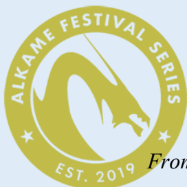
From SkyScene Niagara