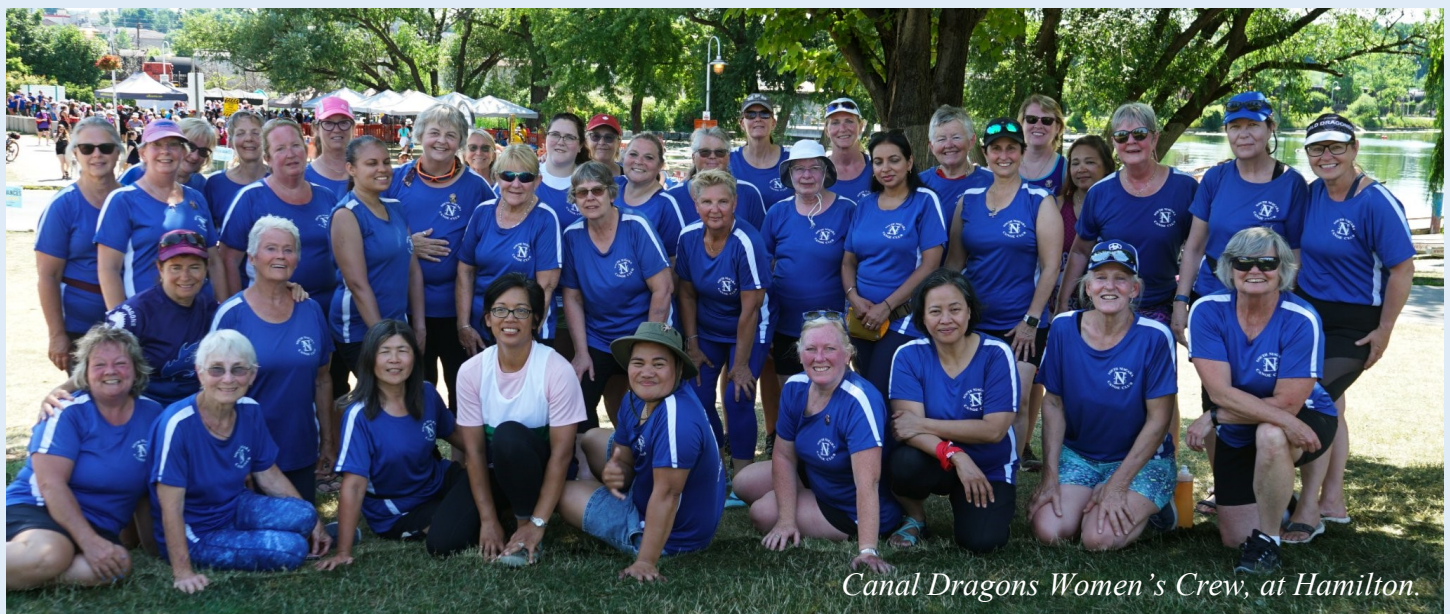
Canal Dragons Women's Crew, at Hamilton.