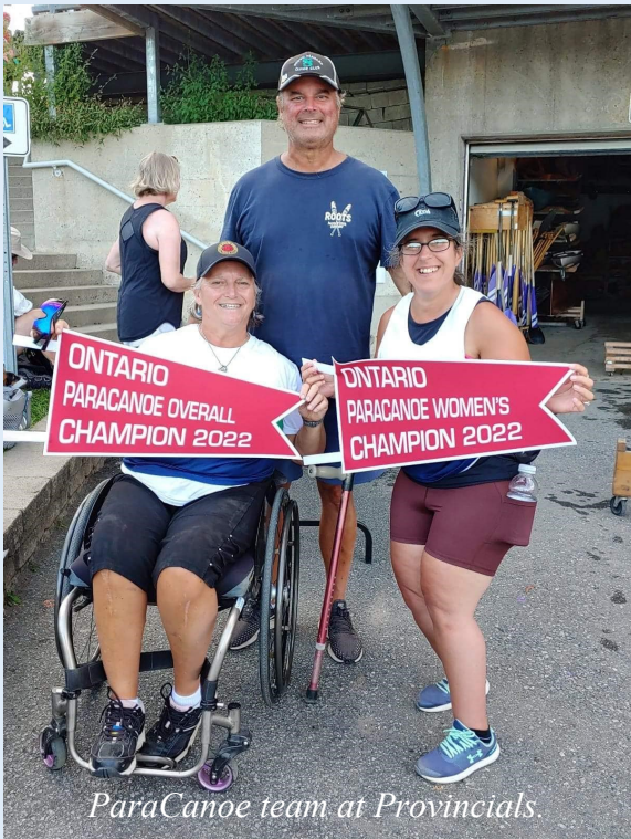
ParaCanoe team at Provincials.