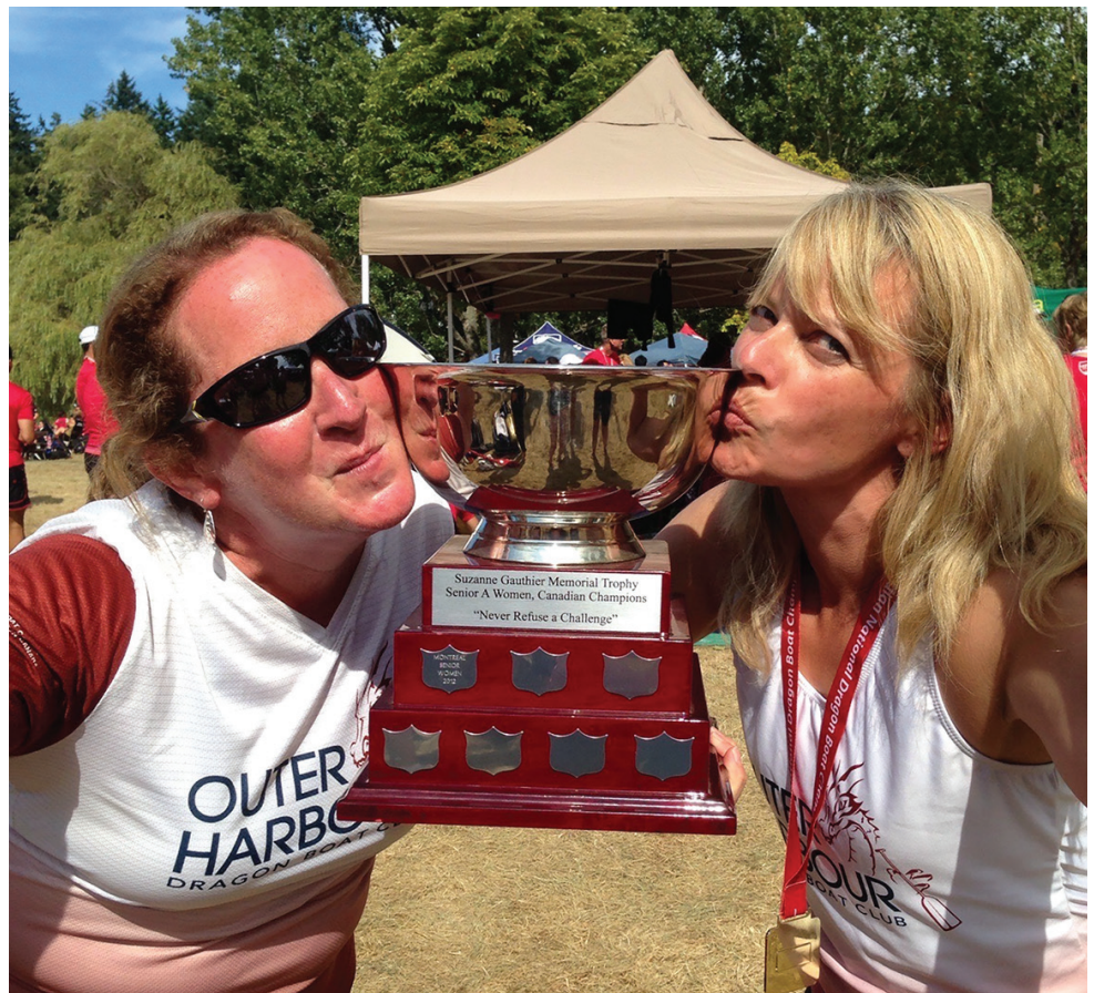
Winning Nationals in Victoria, BC.

I'm looking forward to learning Kayak and continuing on my Dragonboat journey this summer with SNCC.